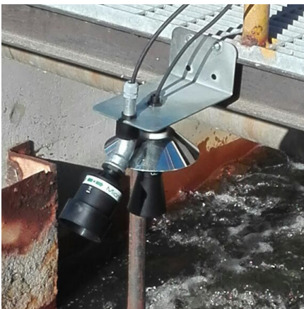
MicroFlow and dBMACH3 in a wastewater application

Thanks to Pulsar's award-winning and world-leading non-contacting technology, the MicroFlow sensor range does not include any serviceable parts and because it makes no contact with the application, there are no wear and tear issues.