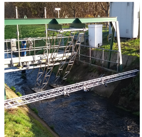
3 MicroFlow's on a wide channel