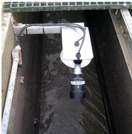
MicroFlow and dBMACH3