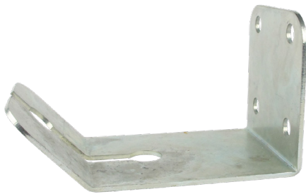
MicroFlow angled bracket

PC software is available to allow setup and run diagnostics using the MicroFlow PC via the RS485 connection. The PC software enables users to be able to set up, test, obtain and record readings from a sensor, giving users an idea of signal strength, stability, device parameters, and much more.